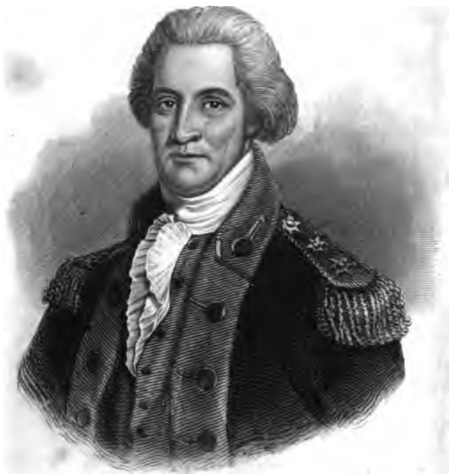
GOV. JOHN SEVIER.